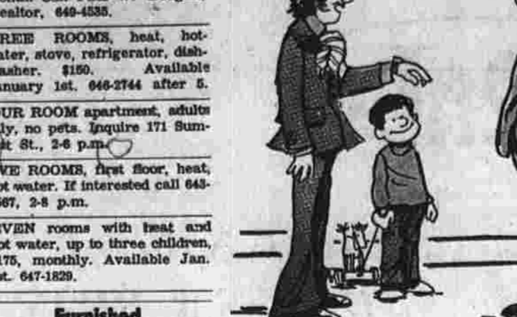
"My son and I gave each other the same things—MICKY MOUSE WATCHES!"