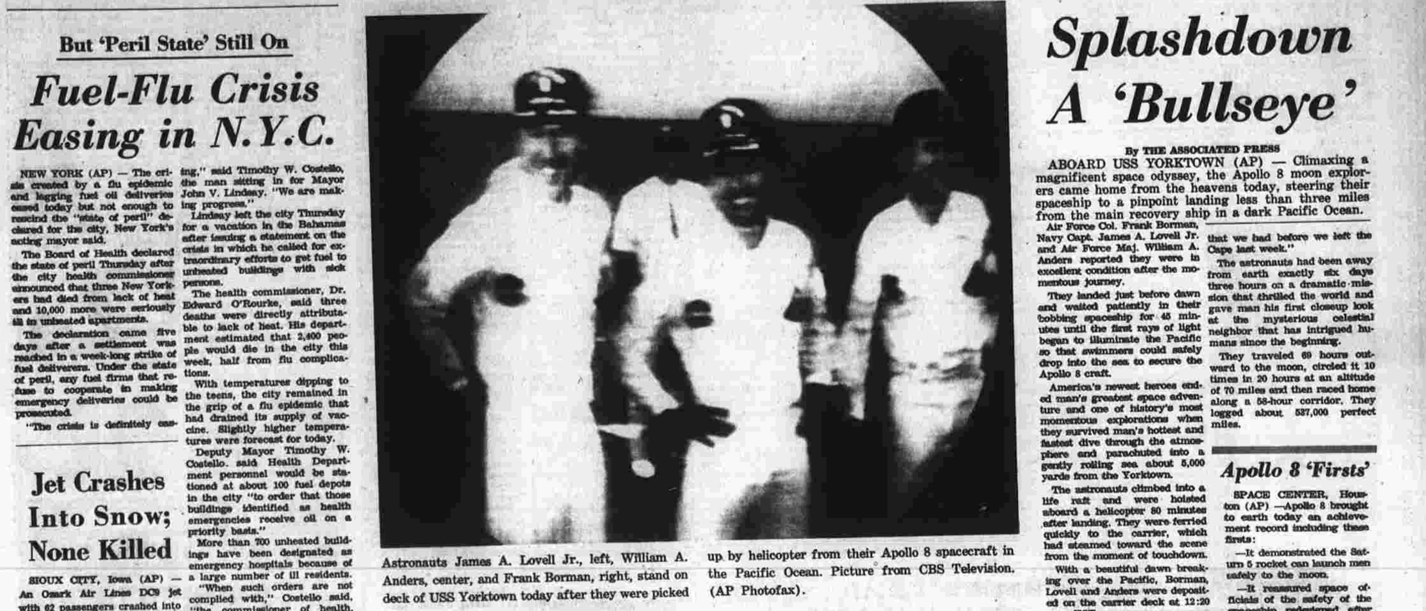
Astronauts James A. Lovell Jr., left, William A. Anders, center, and Frank Borman, right, stand on deck of USS Yorktown today after they were picked up by helicopter from their Apollo 8 spacecraft in the Pacific Ocean.

President Phones Word of Splashdown Wives Endure Ordeal in Prayer