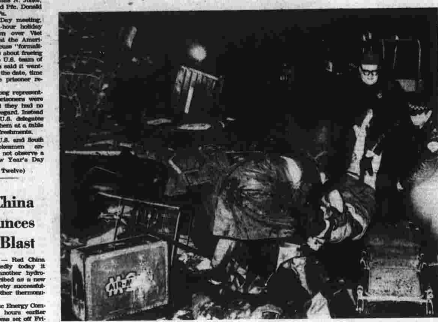
Rescue workers lift the body of an unidentified woman onto a stretcher in a Braniff Airlines hangar at Chicago's O'Hare International Airport...